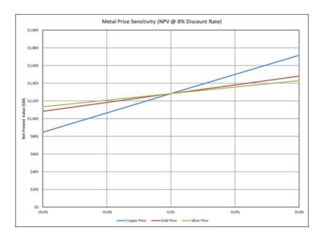
Figure 3: Metal Price Sensitivity